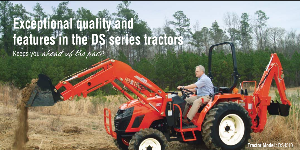
Tractor Model - DS4510